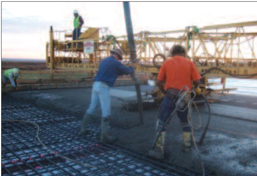
Good practices in placing, finishing, protecting, and curing silica-fume concrete include placing the material close to the finishing machine; vibrating to ensure good consolidation; and covering to protect and cure.

■ Stickiness. First-time finishers of silica-fume concrete frequently report that it is “sticky and difficult to work